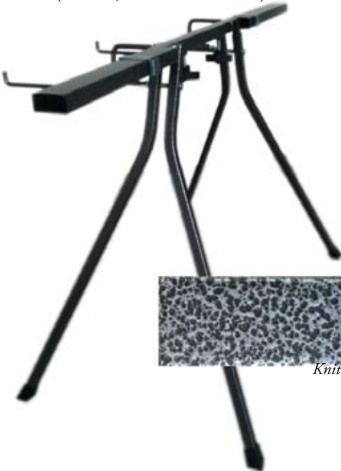
Knitting Machine Stand