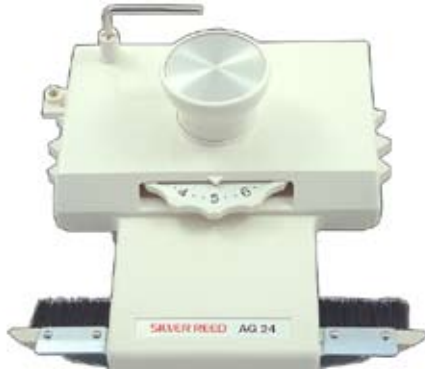
AG24 Intarsia Carriage

Allows you to knit as many colors in a single row as you like. Knit pictorial and geometric designs without floats! Lay your yarns over selected needles manually and pass the intarsia carriage over the needles to knit the new stitches.