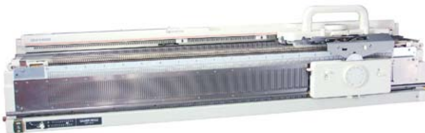
SRP60N Ribber attached to SK840

Most commonly used for automatic ribbing. When attached to the main bed, the ribbing attachment will add another dimension to your knitting as it can perform a variety of rib stitches; multi-color rib, english rib, tuck rib, tubular knitting, drive lace and much more.