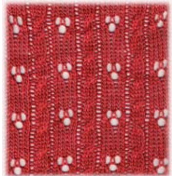
hand manipulated cables and lace done on the LK150 design/knit by Angelika Yarn: Alchemy Yarn Silk Purse 100% Silk