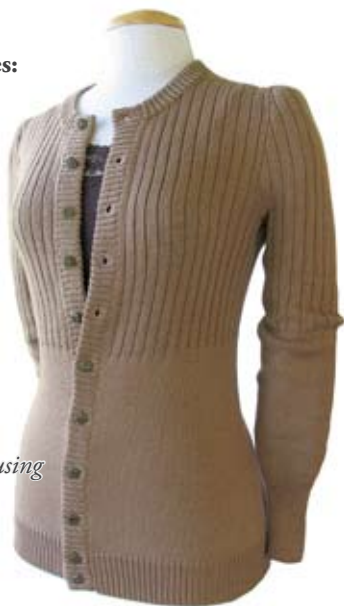
Cardigan knit in fingering weight yarn using standard gauge machine and ribber