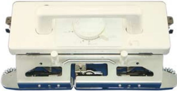
LC580 Lace Carriage for SK840

Transfer stitches for lace patterns in a single action. Lace Carriage knits and transfers in a single pass according to the design selected. Capable of producing fashionable multiple lace transfer designs.