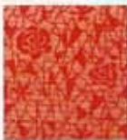
Large motif knit-in pattern

A pattern is formed stitch by stitch by freely moving a blinking dot on the liquid crystal display. It is easy to correct and arrange a pattern easily, and an original pattern can be designed quickly. A large pattern equivalent to up to 1,000 rows by 200 stitches can be created.