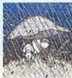
Large motif knit-in pattern